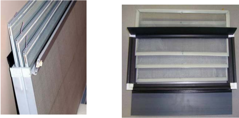
Figure 3. Filtration case showing the three levels of filtration